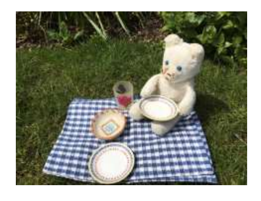
Maybe you could make a diary for your teddy