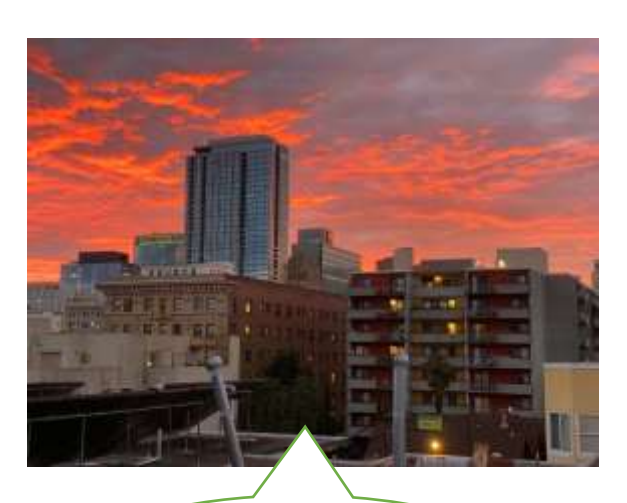
Watching the sun rise and set over the city.