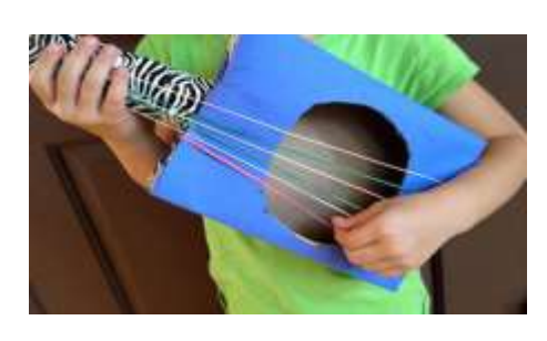
Maybe you could make a musical instrument to play when you Clap for Carers

I have had a lot of fun making a diary for my Teddy (just like Ginger's diary). In it, I am recoding all the things 'Teddy' has done during lockdown. Next week it is his birthday, so I am going to plan a party.