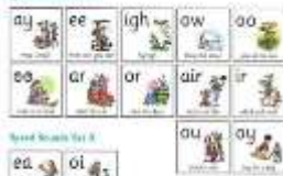
Speed Sounds Set 3