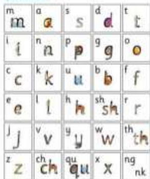
Speed Sounds Set 1